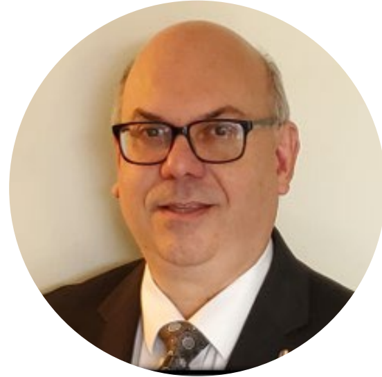
STATE SECRETARY DA LIAISON