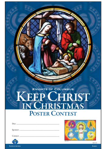
Keep Christ in Christmas Poster Contest Poster (#5026)