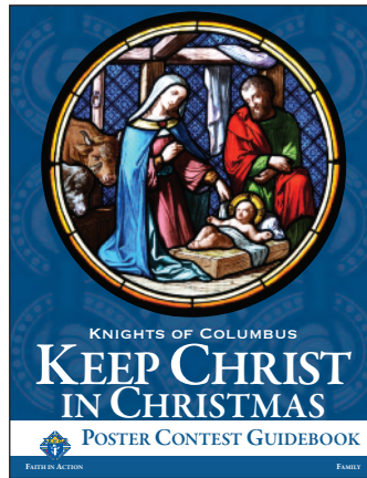
Keep Christ in Christmas Poster Contest Guidebook (#5024)