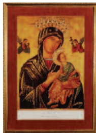
1984-85 Our Lady of Perpetual Help