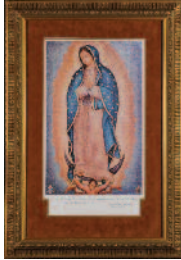
2000-01 Our Lady of Guadalupe