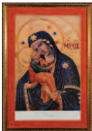
1988-89 Our Lady of Pochaiv