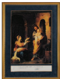
1993-94 Holy Family