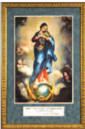
2013-14 Immaculate Conception