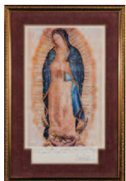
1995-96 Our Lady of Guadalupe