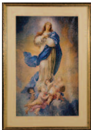
1981-82 Immaculate Conception