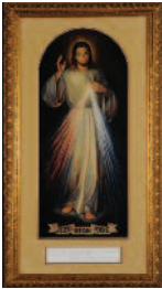
2003-04 Divine Mercy