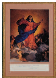
1990-91 Our Lady of the Assumption