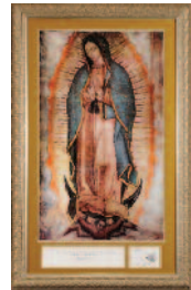
2011-13 Our Lady of Guadalupe