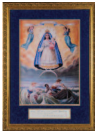
2007-08 Our Lady of Charity