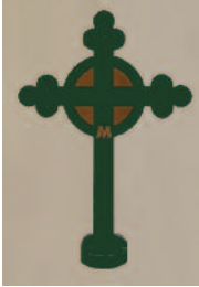
1999-2000 Millennium Cross