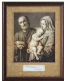
2015-16 Holy Family