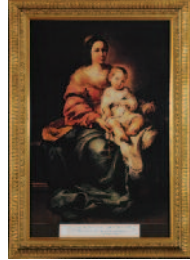
2002-03 Our Lady of the Rosary